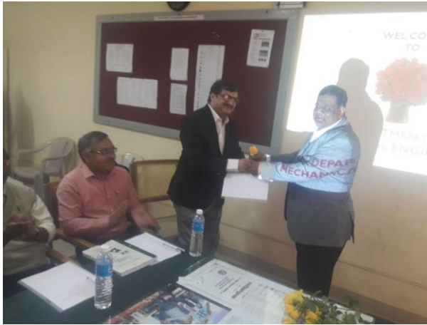
PWC Meeting On 29-12-2017