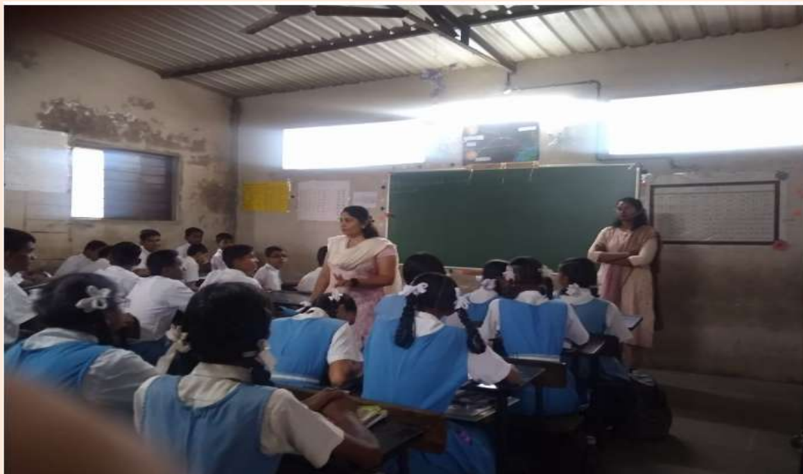
Adarsh Vidyamandir Nashik East at 14/12/22.