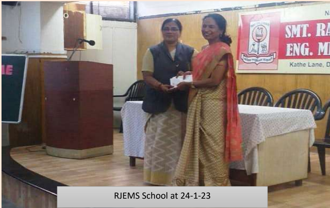
RJEMS School at 24-1-23