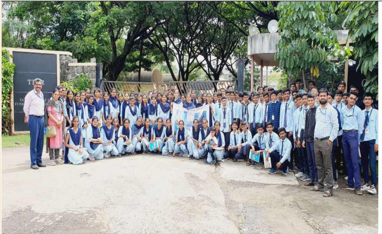
Industrial visit to GMRT, Narayangaon of IIEL(A) on 14/10/2022