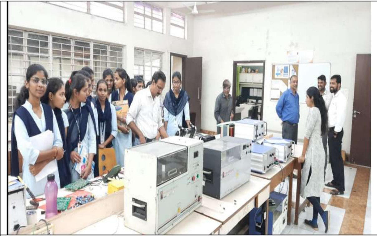
Industrial visit to Sivanand Electronics ,Deolali Nashik of IIEL(B) on 30/09/2022