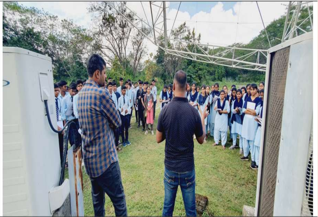
Industrial visit to GMRT, Narayangaon of IIEL(B) on 14/10/2022