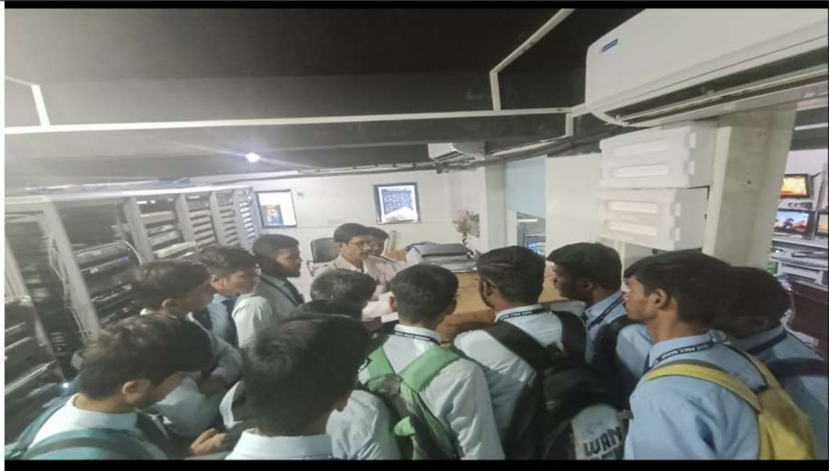
Industrial visit to DEN cable Network Nashik of IIIEL(B) on 30/09/2022