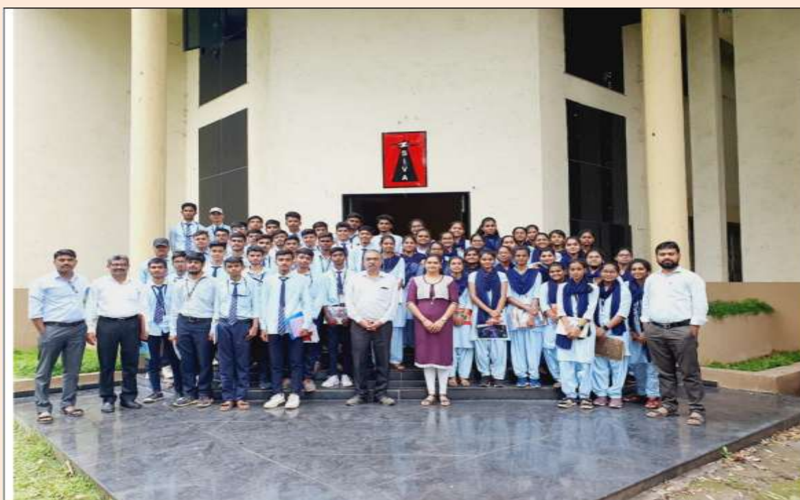
Industrial visit to Sivanand Electronics ,Deolali Nashik of IIEI(A) on 23/09/2022