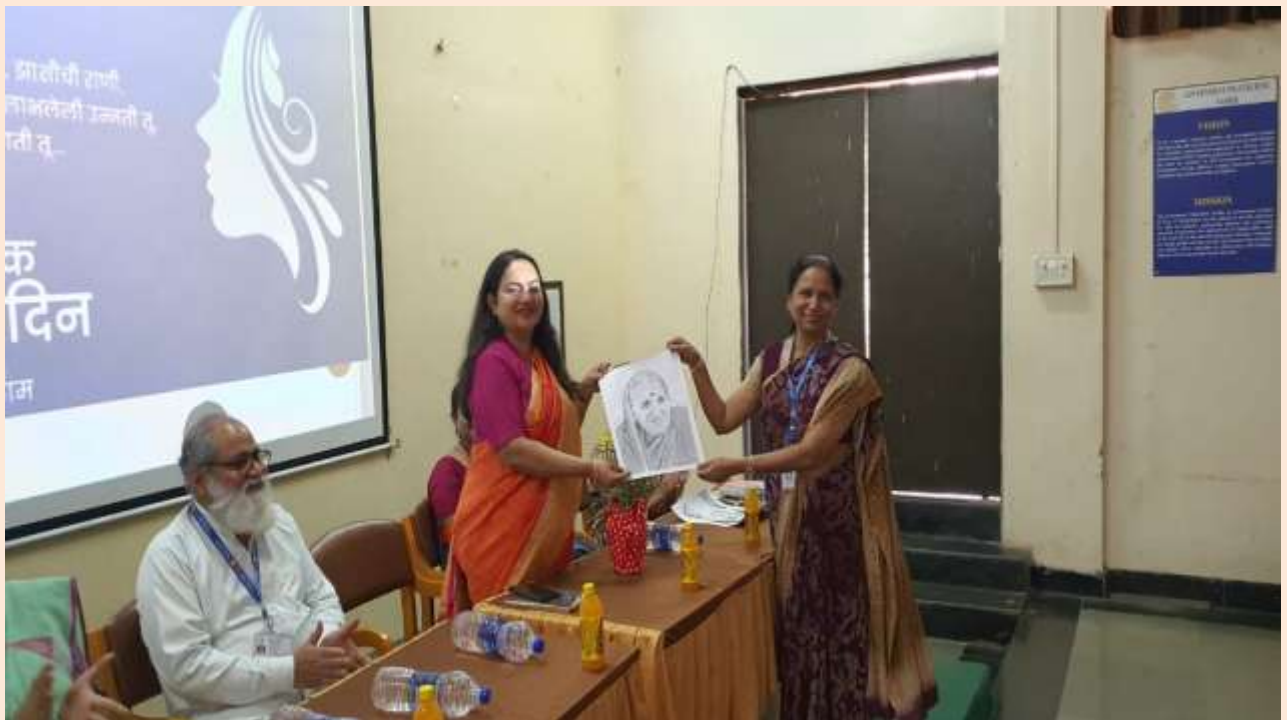
SCHOOL CONNECT PROGRAM 2022-2023