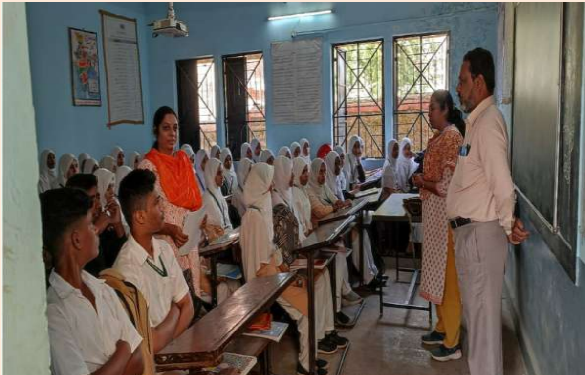
NMC Urdu High School Nashik at 14/12/22