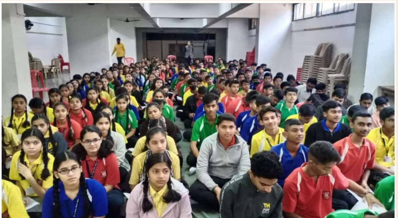
KBH Vidyalaya Vadala at 13/12/22