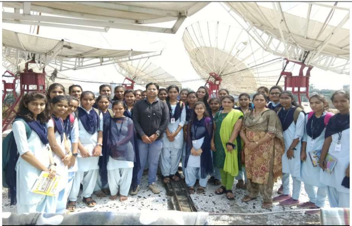
Industrial visit to DEN cable Network Nashik of IIIEL(A) on 30/09/2022