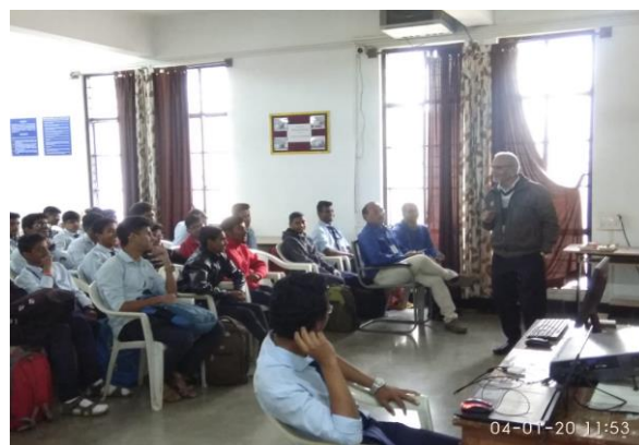
Expert Lecture on Industrial Safety on 04/01/2020