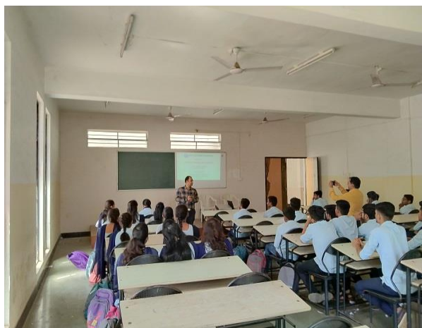
Expert Lecture on Advanced Manufacturing Techniques on 11/03/2020