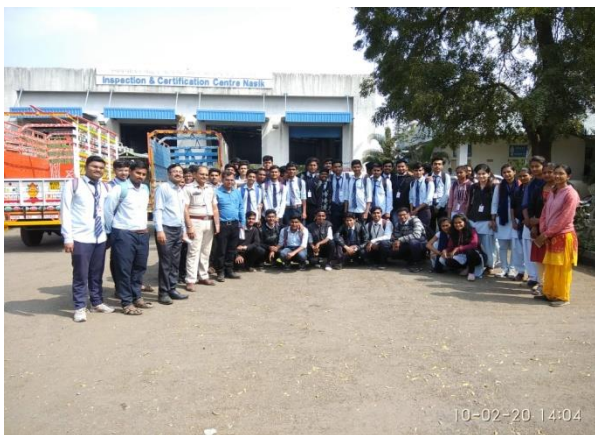
Industrial Visit to RTO office, Inspection and Certification Center Nashik, on 10/02/2020