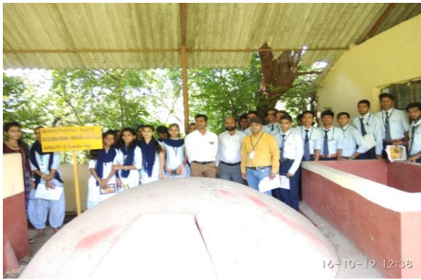
Industrial Visit to Dr.B.R.Ambedkar Institute of Rural Technology and Management, Khadi and Village Industries Commission, Nashik, on 16/10/2019