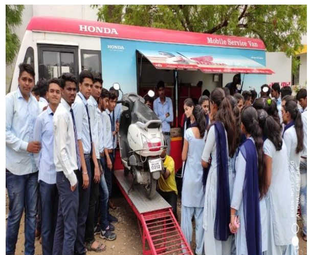
Workshop on Two Wheeler free Check-up, Honda Two Wheeler, Nashik on 26/06/2019