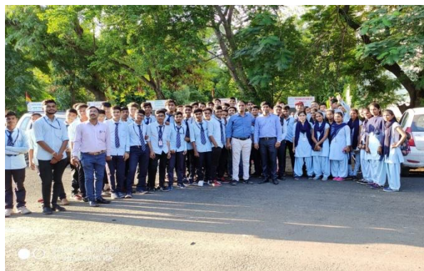
Industrial Visit to Thermal Power Plant, Eklahare, Nashik on 23/07/2019