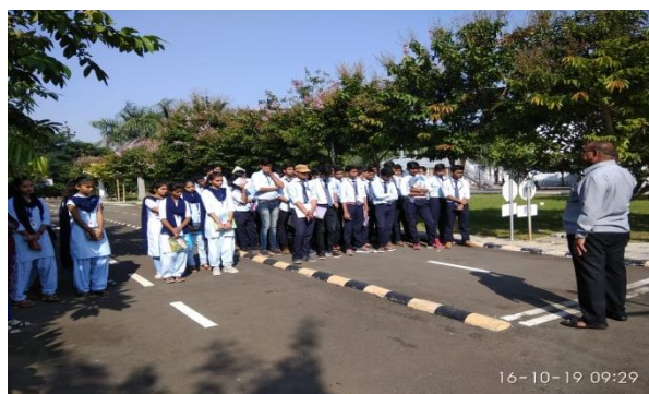
Industrial Visit to Traffic Education Park Nashik, on 16/10/2019