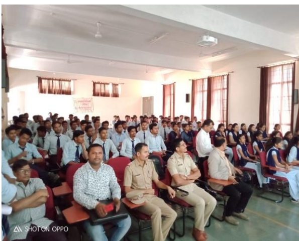
Workshop on Road Safety Awareness, RTO Nashik on 03/03/2020