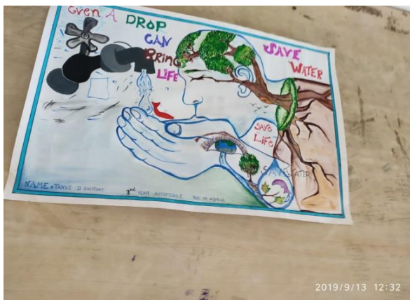
Engineers Day, Poster Presentation on 13/09/2019