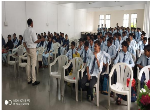
Teacher day, Quiz Competition on 05/09/2019