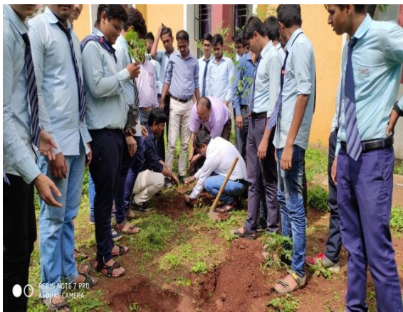
Induction Program for 1st Year Diploma Students on 06/08/2019 to 08/08/2019