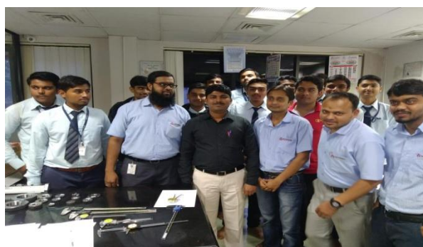
Industrial Visit to Accurate Engineering. Co.Pvt.Ltd.Nashik on 31/07/2019