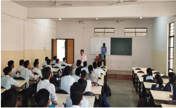
Workshop on Rapid Prototyping on 28/02/2020