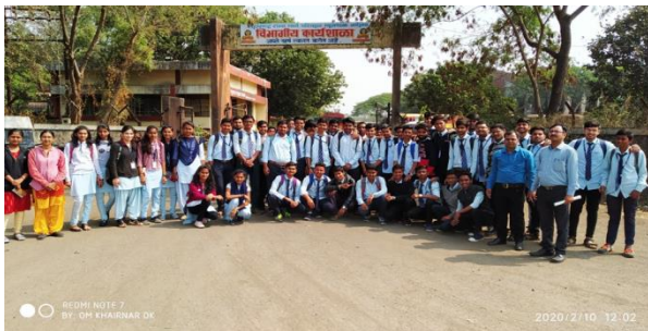
Industrial Visit to MSTRC Divisional Workshop Nashik, on 10/02/2020

C. Number of industry sponsored projects – 01