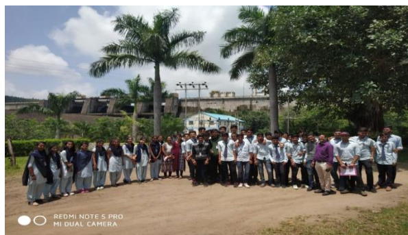
Industrial Visit to Hydroelectric power Plant, Chaska man, Pune, on 23/08/2019