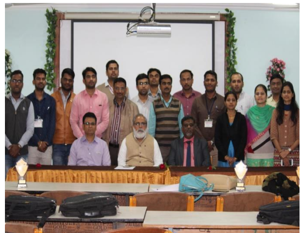
The Participants and the Coordinators with hon. Principal posed for the memorance of the program.