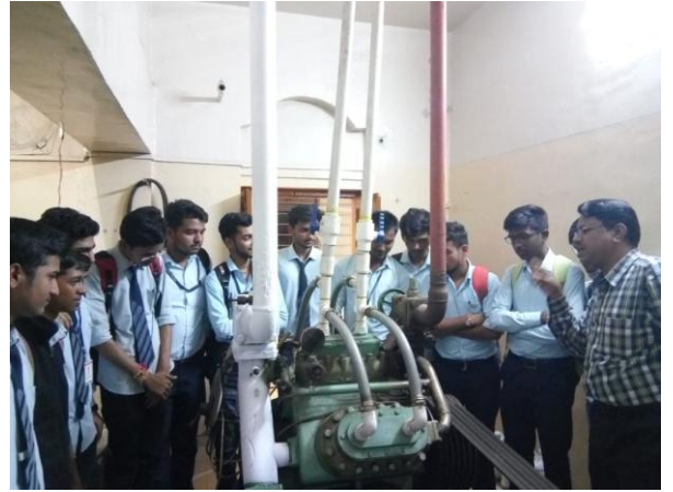
Industrial visit organized for the student of II ME ( SS ) at Narang Cold Storage MIDC Satpur Nashik.