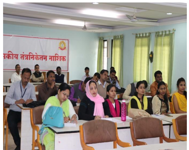
There were total 30 Participants attended the programme.