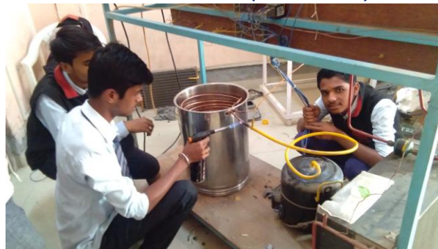
Students busy in Project Work 19 March 2018