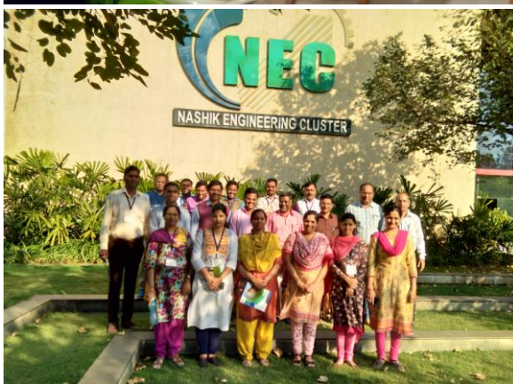
Visit to Nashik Engineering Clusture (NEC) on 03/02/2018