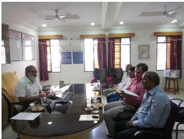
At Mechanical Department