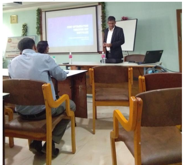
Cost Optimization through ERP Software Date : 03/02/2018

Research Methodology and Optimization Techniques (RMOT -2018) Concluded on 03/02/2018 and the certificates were distributed to the participants. All the participants felt that this programme contents will be very valuable to them and ultimately benefit to their students.