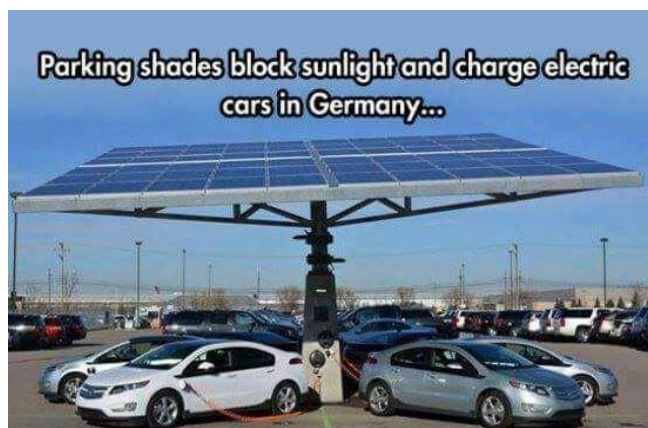
Parking shades block sunlight and charge electric cars in Germany...