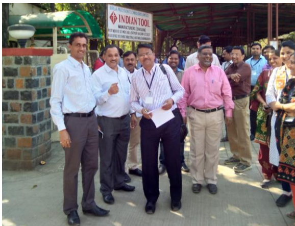
Visit To Indian Tools , Birla Precession Technologies Nashik 03/02/2018